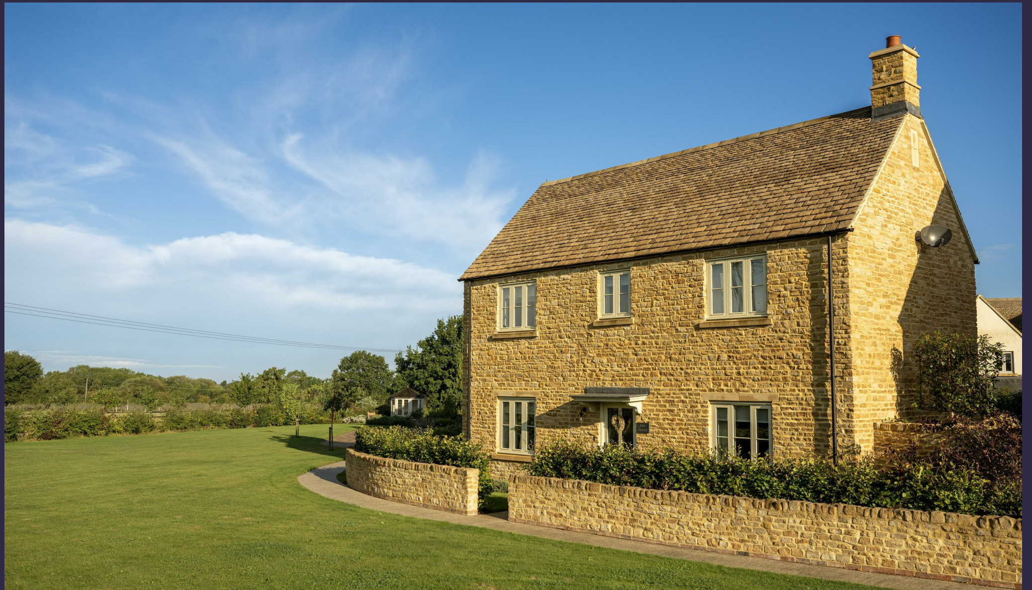
Elm House Broadway Road, Willersey, Broadway, WR12 7PH